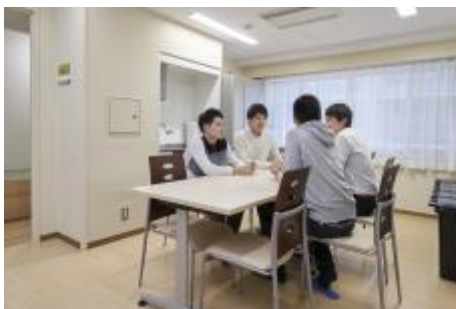
Takiyama International Dormitory